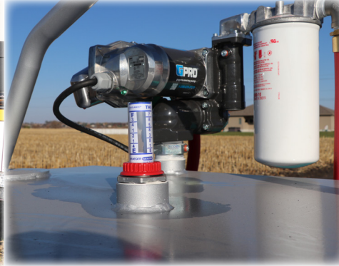
DIESEL FUEL GAUGE, 12V ZS 6PM DIESEL PUMP