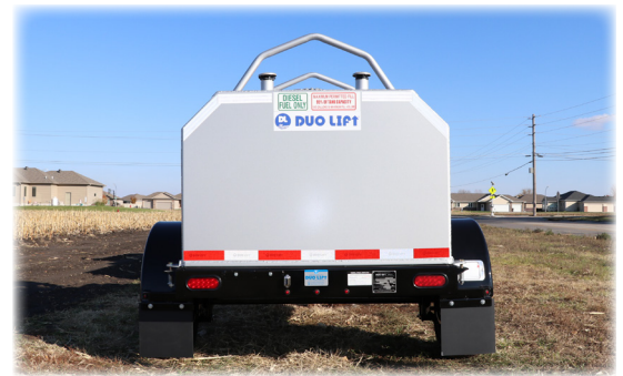
REAR BUMPER, TAILLIGHTS, LICENSE PLATE LOCATION AND VIN ID PLATE