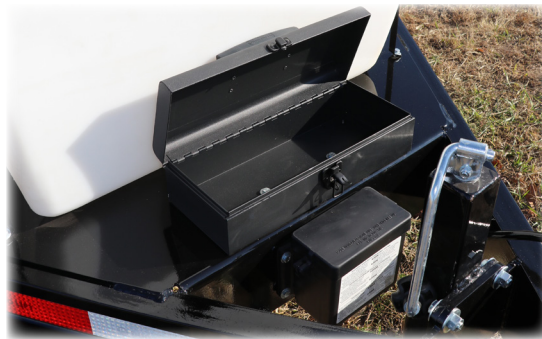
802062 TOOL BOX KIT