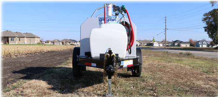
7,000 LB DROP LEG, BOLT ON TOP-WIND TONGUE JACK