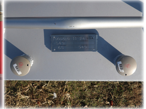
LOCKING PRE-VENT CAPS WITH TANK VENTING AND DIESEL TANK IDENTIFICATION PLATE