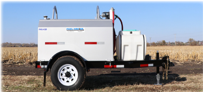
SILVER PAINTED DIESEL FUEL TANK, BLACK TRAILER COLOR