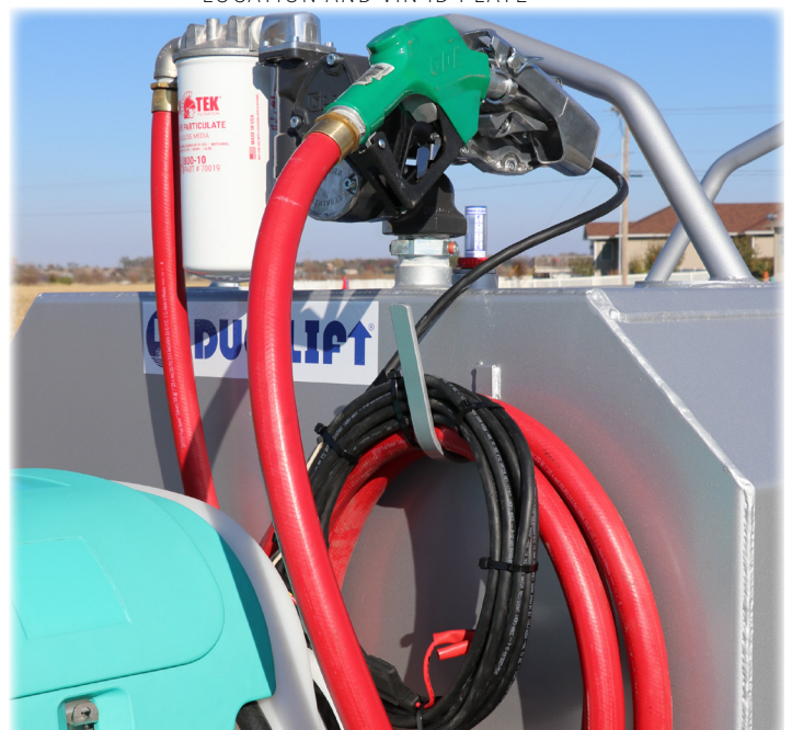
12V, 256PM DIESEL PUMP, 25' HOSE, 30' POWER CORD AND DIESEL FUEL FILTER