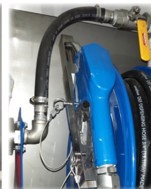
PATENT PENDING DIESEL AND D.E.F. STAINLESS STEEL NOZZLE HOLDERS W/ DRIP CONTAINMENT TUBES