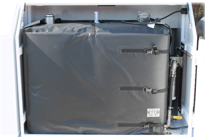
OPTIONAL 50, 80 OR 100 GALLON D.E.F. SYSTEMS (100 GALLON SHOWN) OPTIONAL 120V 835 Watt, Auto Temperature Controlled, D.E.F. Tank Heater Blanket (40°F to -10°F Operational Temperature)