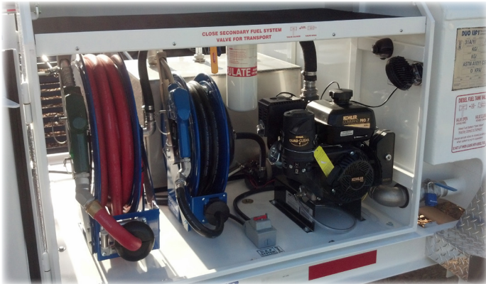
KOHLER POWERED 30-35 GPM DIESEL PUMPING SYSTEM, 12V DEF PUMP AND HOSE REELS