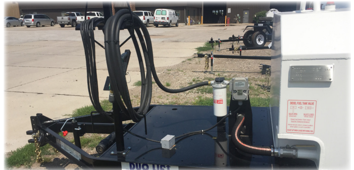
12V, 20-25 GPM DIESEL PUMPING SYSTEM WITH 25' DIESEL HOSE