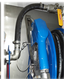
PATENT PENDING DIESEL AND D.E.F. STAINLESS STEEL NOZZLE HOLDERS W/ DRIP CONTAINMENT TUBES