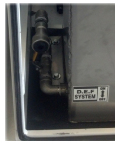
D.E.F. TRANSFER SYSTEM OPTION