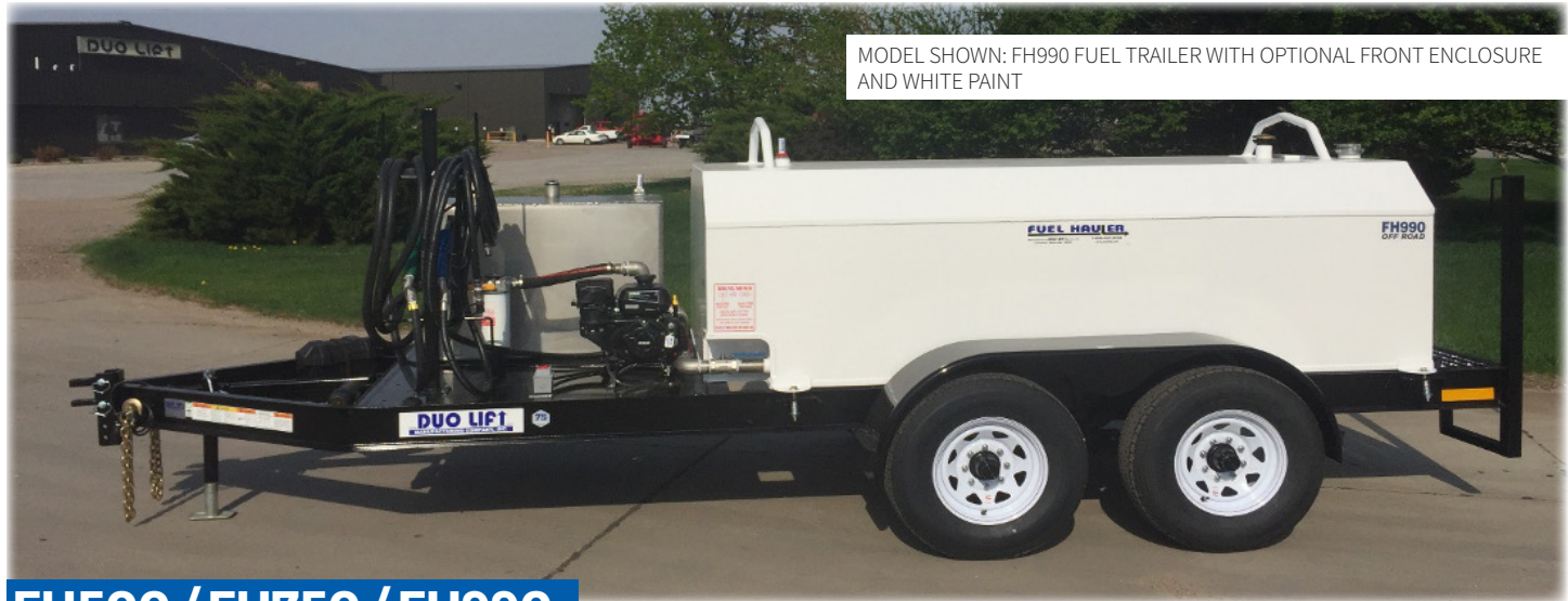
MODEL SHOWN: FH990 FUEL TRAILER WITH OPTIONAL FRONT ENCLOSURE AND WHITE PAINT