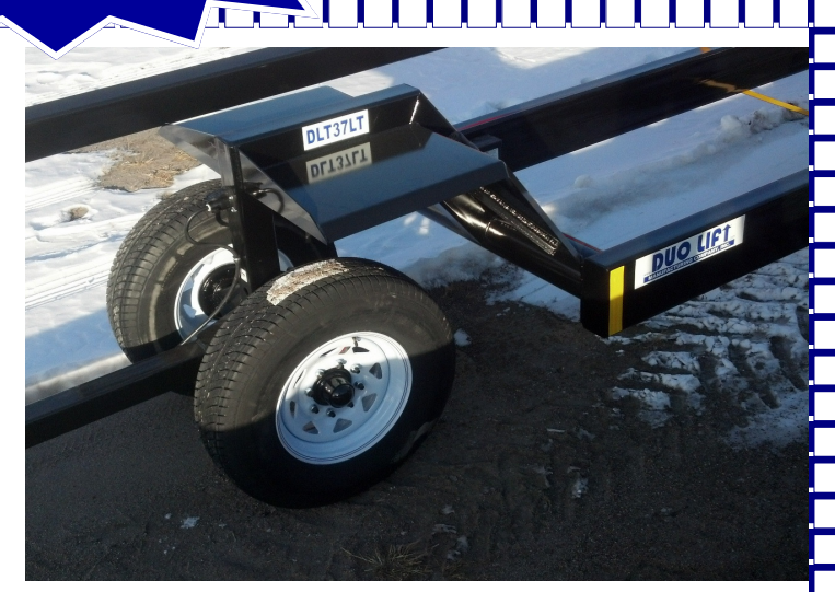
P/N 800618 Front Steel Fender Option