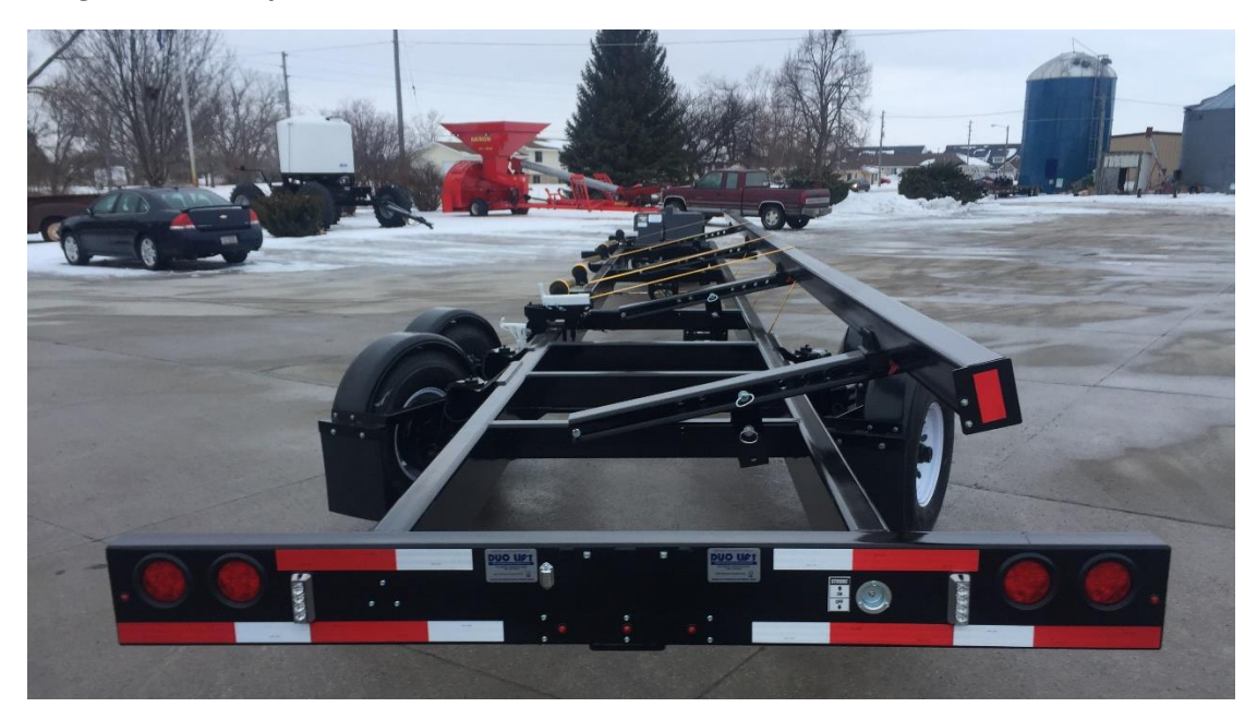
D.O.T. Rear Bumper with Optional Strobe Lights

All Wheel Steering of Front Dolly Wheels and Rear Tandem Axles with Electric Brakes, Fenders and Torsion Suspension