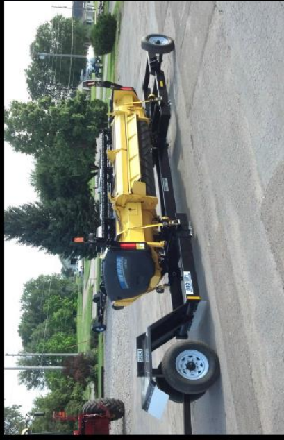
SH24LT - Loaded 16' Sickle Head