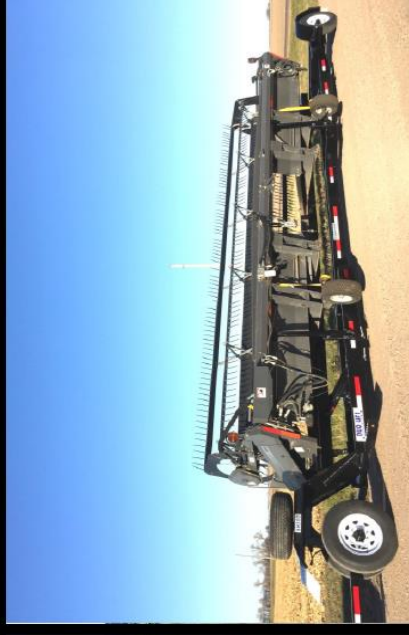
SH30LT - Loaded with 30' Draper Head