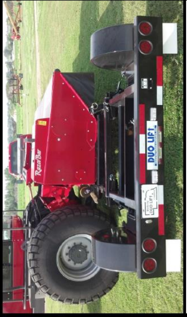
Loading 16' Rotary Disc Header on SH24D (Rear View)