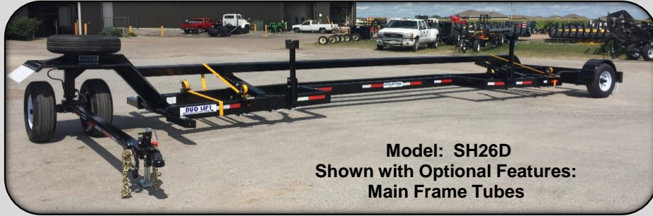
Model: SH26D Shown with Optional Features: Main Frame Tubes

Manufactured by DUO LIFT® Mfg. Co., Inc.