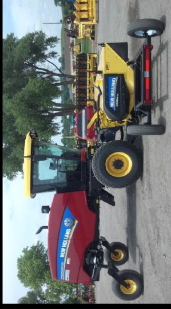
Duo Lift Swather Head Hauler Trailers are Capable of Hauling Most Swather and Windrower Headers SH24LT Shown with 19.4" Rotary Disc Header