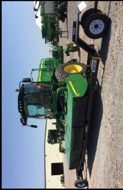
Loading 16' Rotary Disc Header on SH24LT