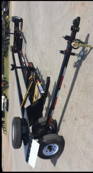
SH26D - D.O.T. Compliant Swather Head Hauler Trailer. Shown with Optional Features: 801195 - Header Bar Package and 801265 - Draper Head U-Saddle Support Arms