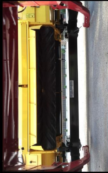
28" x 132" Frame Access for Header Lift Arms. Adjustable Header Supports Accommodate most Swather and Windrower Headers