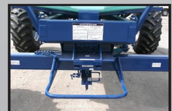
Patented "E-Z Lock" System