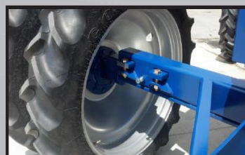
Optional Adjustable Track Width