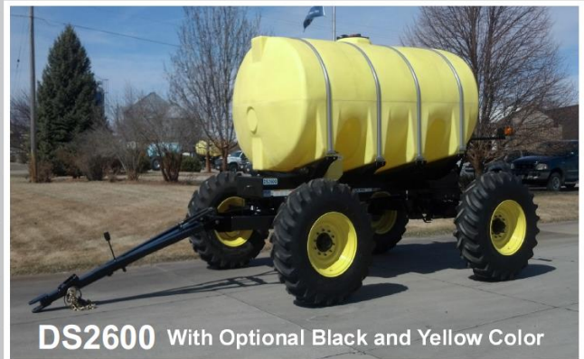
DS2600 With Optional Black and Yellow Color

The Duo Steer Wagon by Duo Lift is a 4-Wheel Steer Wagon designed for your Fertilizer Applicator Bar, Row Crop Planter, Air Seeder and More. The Patented "E-Z Lock" System, locks the rear axle in the fixed position for road use or steerable position for field use in seconds by the flip of a lever. No disconnecting or connecting of a tie rod is necessary. This Heavy Duty Wagon utilizes 18.4 X 26 Lug Tires. Wagons for 1000, 1200, 1600, 2000 to 2600 Gallon Liquid Tanks and Single or Dual Anhydrous Tanks. An Optional 400 Gallon Front Tank is Available.