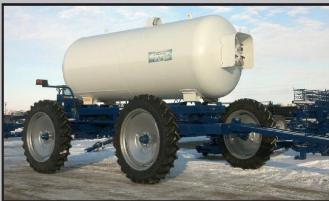
DS2110 with Optional 2000 Gallon NH3 Tank and 320/85R38 Tires