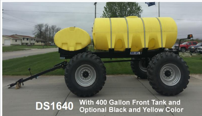
DS1640 With 400 Gallon Front Tank and Optional Black and Yellow Color