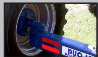
Replaceable Spindle in Reduced Height Position