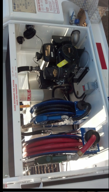
Kohler Powered 30 - 35 GPM Diesel Pumping System with 50 Gallon D.E.F. Tank.