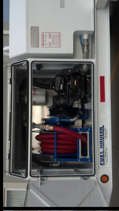
Kohler Powered 40 - 55 GPM Diesel Pumping System with 80 Gallon D.E.F. Tank.