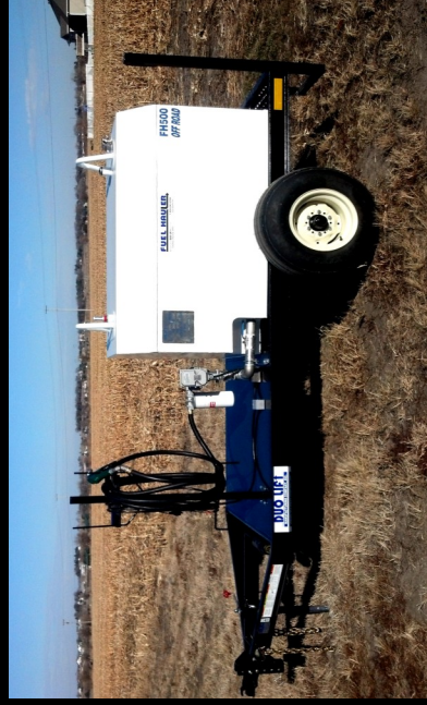
FH500 OFF ROAD