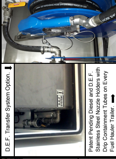
D.E.F. Transfer System Option. ↓