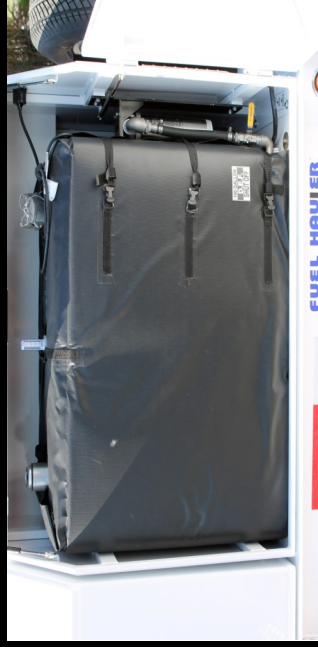
Optional 50, 80 or 100 Gallon D.E.F. Systems. (100 Gallon Shown). Optional 120V 835 Watt, Auto Temperature Controlled, D.E.F. Tank Heater Blanket (40°F to -10°F Operational Temperature) with External Covered 120V Electrical Socket. Factory or Field Installed.