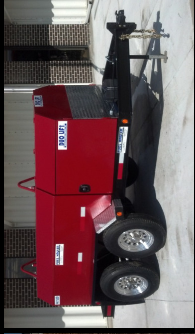
FH750D with Red and Black Color Option.