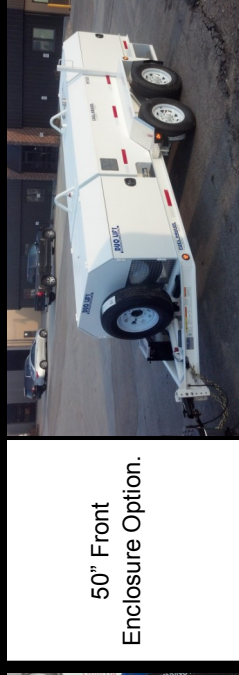
50" Front Enclosure Option.