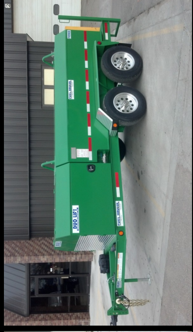
FH990D with Green Color Option.