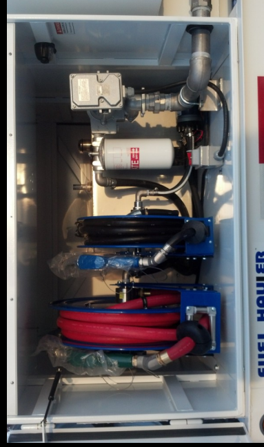
12V, 20 - 25 GPM Diesel Pumping System with 50 Gallon D.E.F. Tank